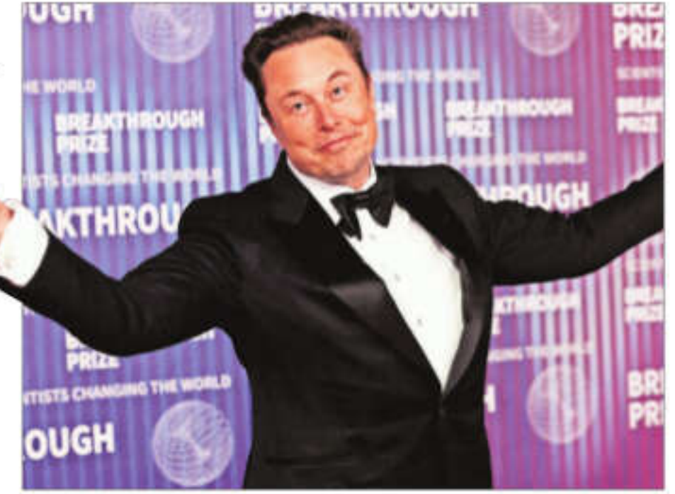
Elon Musk attends the Breakthrough Prize awards in Los Angeles, California

Subsidy structure: The waiver of duties is specifically for models of electric cars with a combined cost, insurance, freight prices of ₹35,000 or above — a landed cost of ₹35