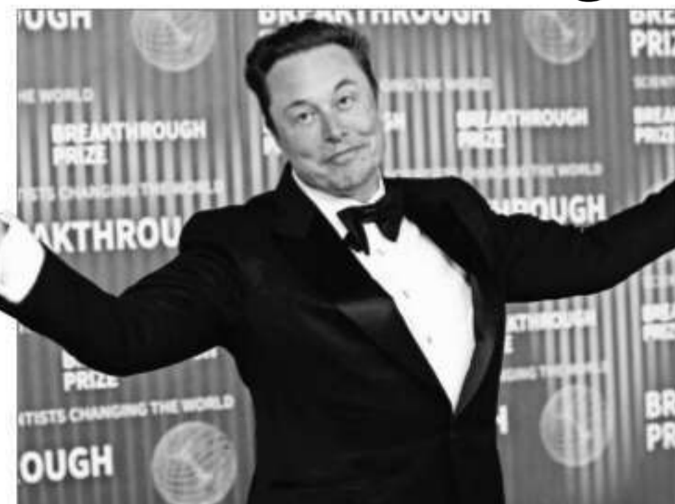
Elon Musk attends the Breakthrough Prize awards in Los Angeles, California

Subsidy structure: The waiver of duties is specifically for models of electric cars with a combined cost, insurance, freight prices of $35,000 or above — a landed cost of ₹35