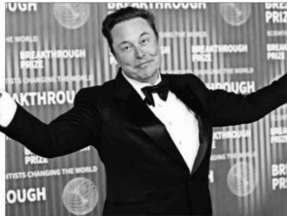
Elon Musk attends the Breakthrough Prize awards in Los Angeles, California

Subsidy structure: The waiver of duties is specifically for models of electric cars with a combined cost, insurance, freight prices of $35,000 or above — a landed cost of ₹35