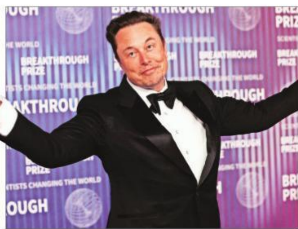
Elon Musk attends the Breakthrough Prize awards in Los Angeles, California

Subsidy structure: The waiver of duties is specifically for models of electric cars with a combined cost, insurance, freight prices of $35,000 or above — a landed cost of ₹35