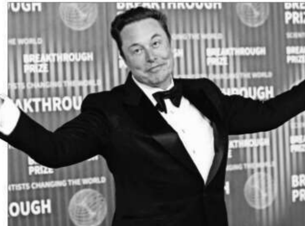
Elon Musk attends the Breakthrough Prize awards in Los Angeles, California

Subsidy structure: The waiver of duties is specifically for models of electric cars with a combined cost, insurance, freight prices of $35,000 or above — a landed cost of ₹35