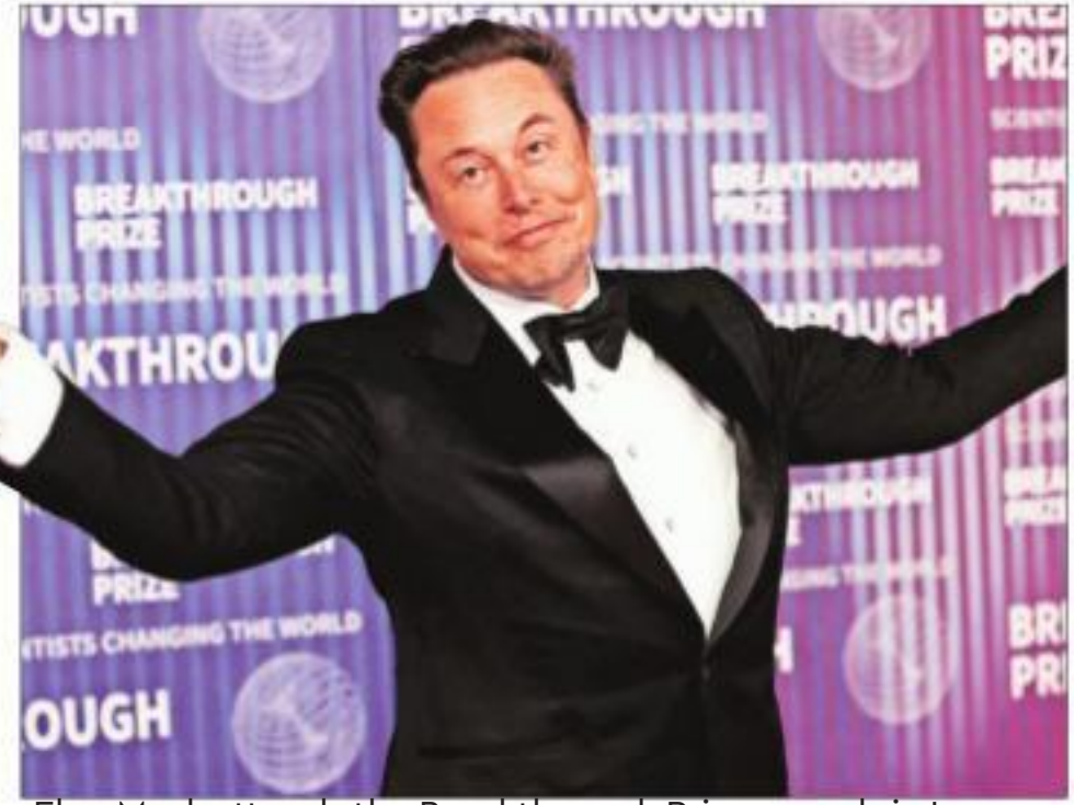
Elon Musk attends the Breakthrough Prize awards in Los Angeles, California

Subsidy structure: The waiver of duties is specifically for models of electric cars with a combined cost, insurance, freight prices of $35,000 or above — a landed cost of ₹35